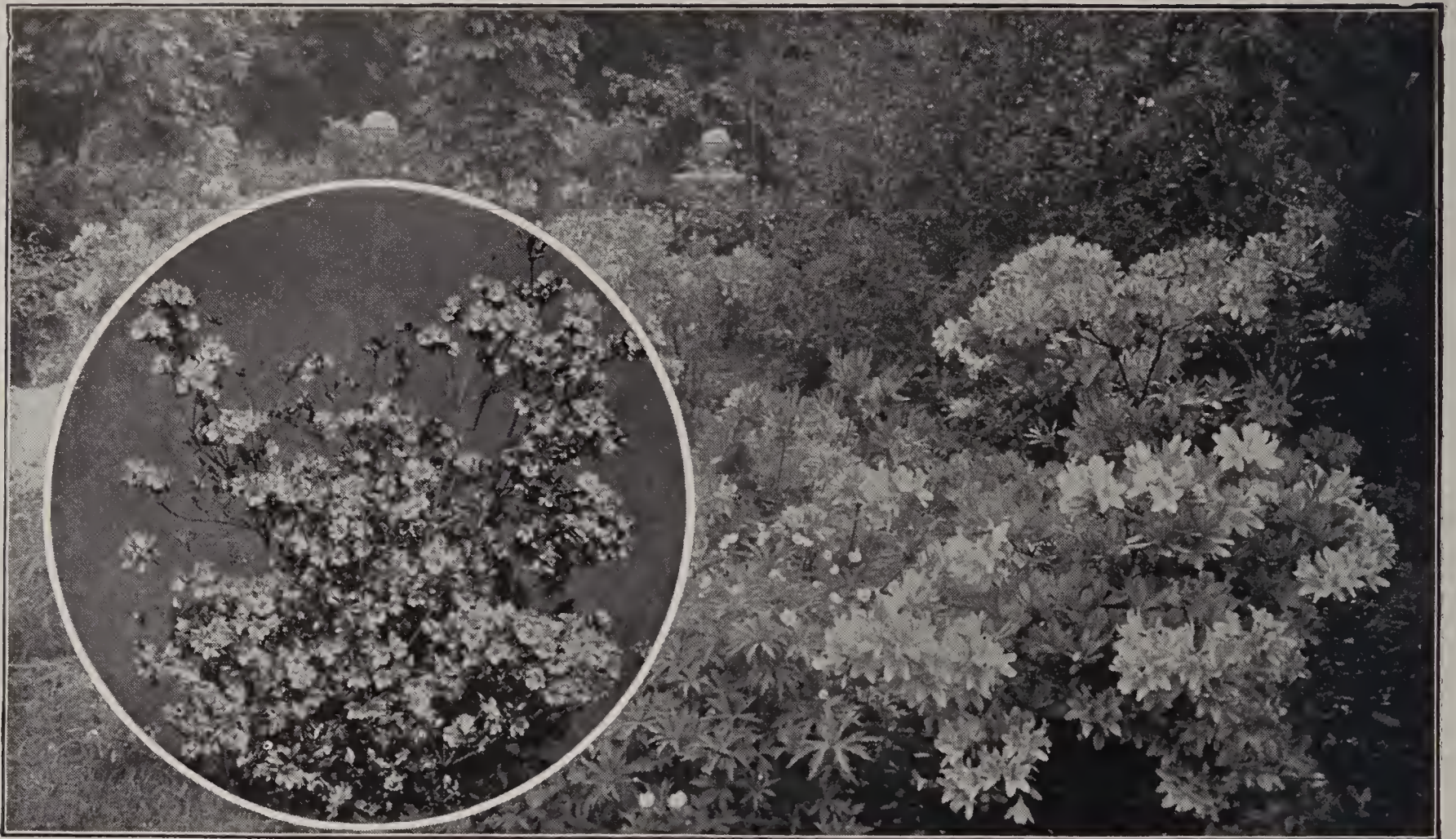
Garden of Hardy Azaleas. Amoena in circle

This Price-List is arranged alphabetically for your convenience in using our descriptive Catalogue. All previously published quotations are canceled by this List.